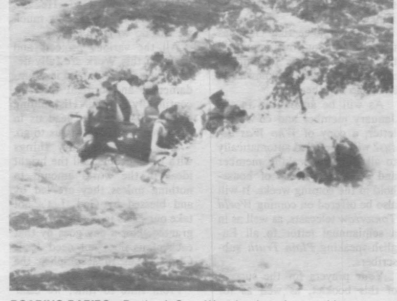
ROARING RAPIDS-Portland, Ore., West brethren brave whitewater on an annual rafting trip.

Each December for about 20 years the church has been host to a basketball jamboree. Teams come from as far away as San Jose, Calif., and Kalispell, Mont. About 45 to 50 teams participate. Just once it was canceled when the roof of its scheduled location caved in a day before activities were to begin.