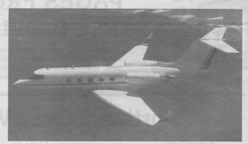
PLANE SOLD—The Church's Gulfstream III jet was delivered Jan. 13 to its new owners, Gulfstream Aerospace Corp. of Savannah, Ga., who purchased the aircraft for $12.5 million.

Thank you again for your prayers and letters of encouragement.